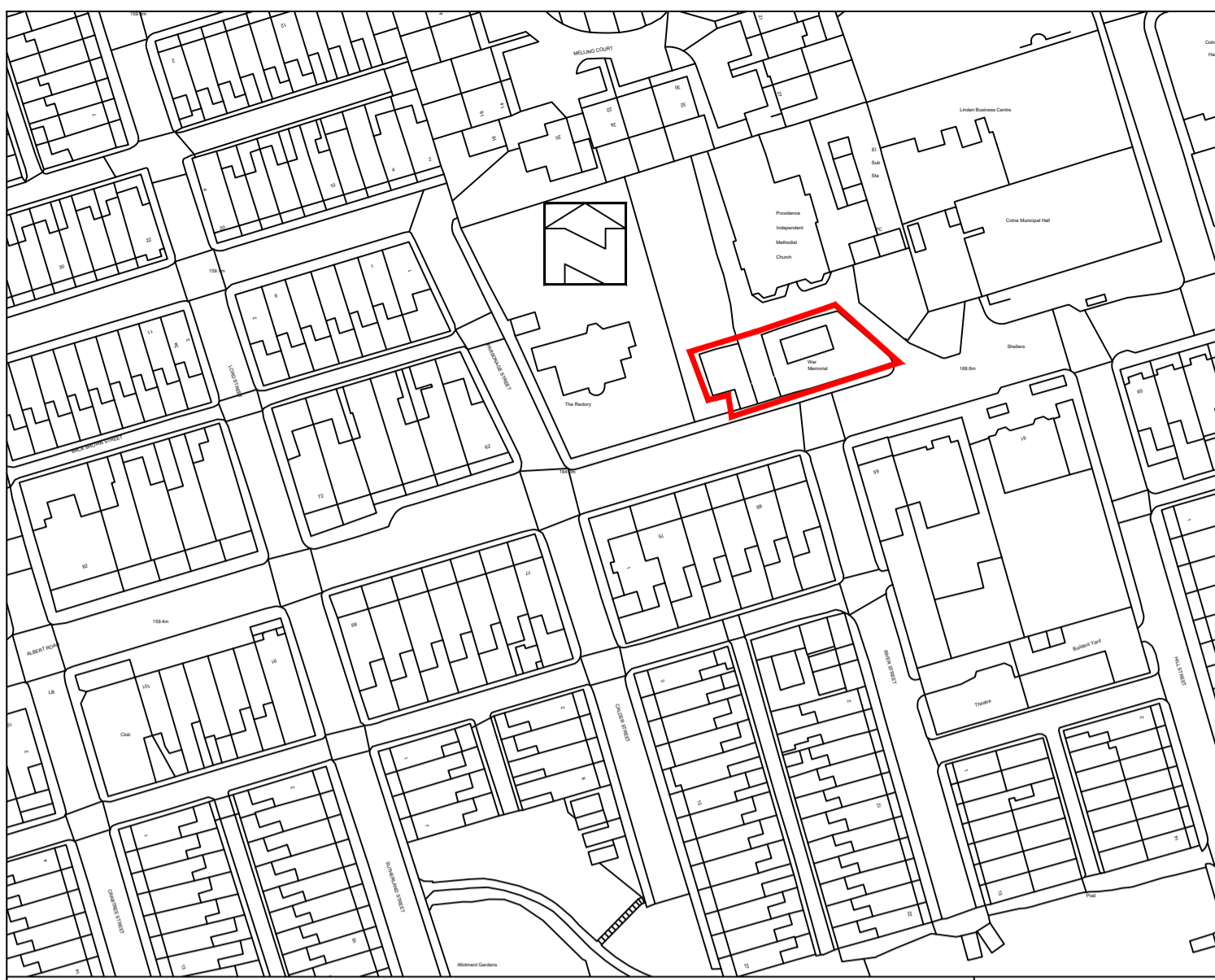
LOCATION PLAN SCALE 1/1250

NOTE - All existing and new flags and kerbs to be bedded on Larson Streetscape FBC ECO high graded bedding mortar, 35mm thick, laid in accordance with BS 7533-101.