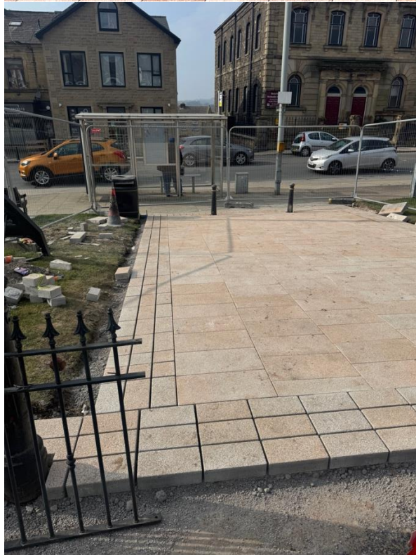
Image shows Kellen pavements being laid in the UKSPF funded public realm scheme in Brierfield