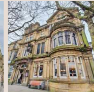
Lord Nelson Hotel