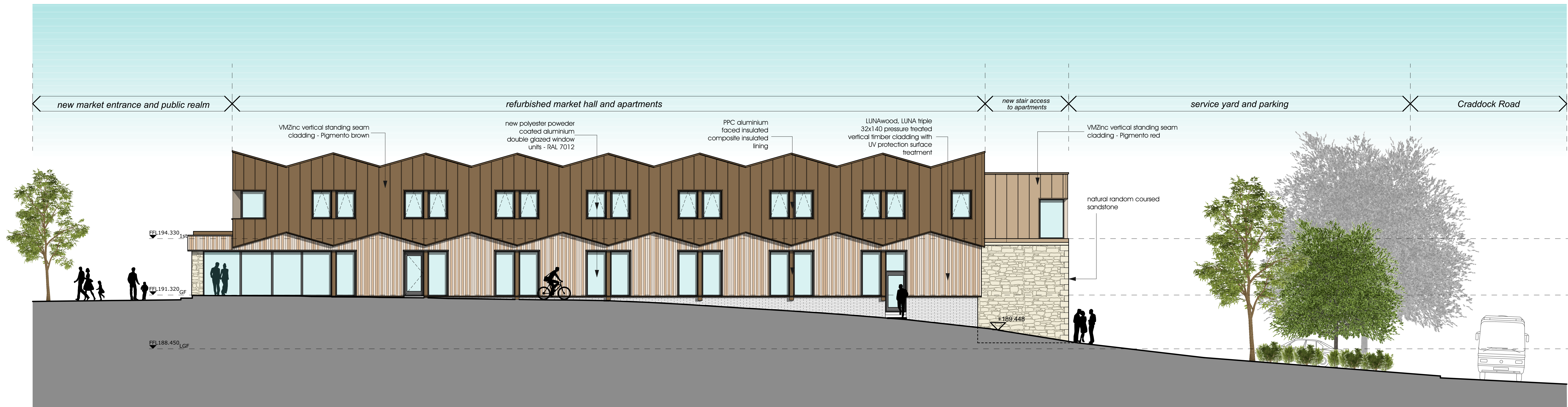
west elevation 1:100