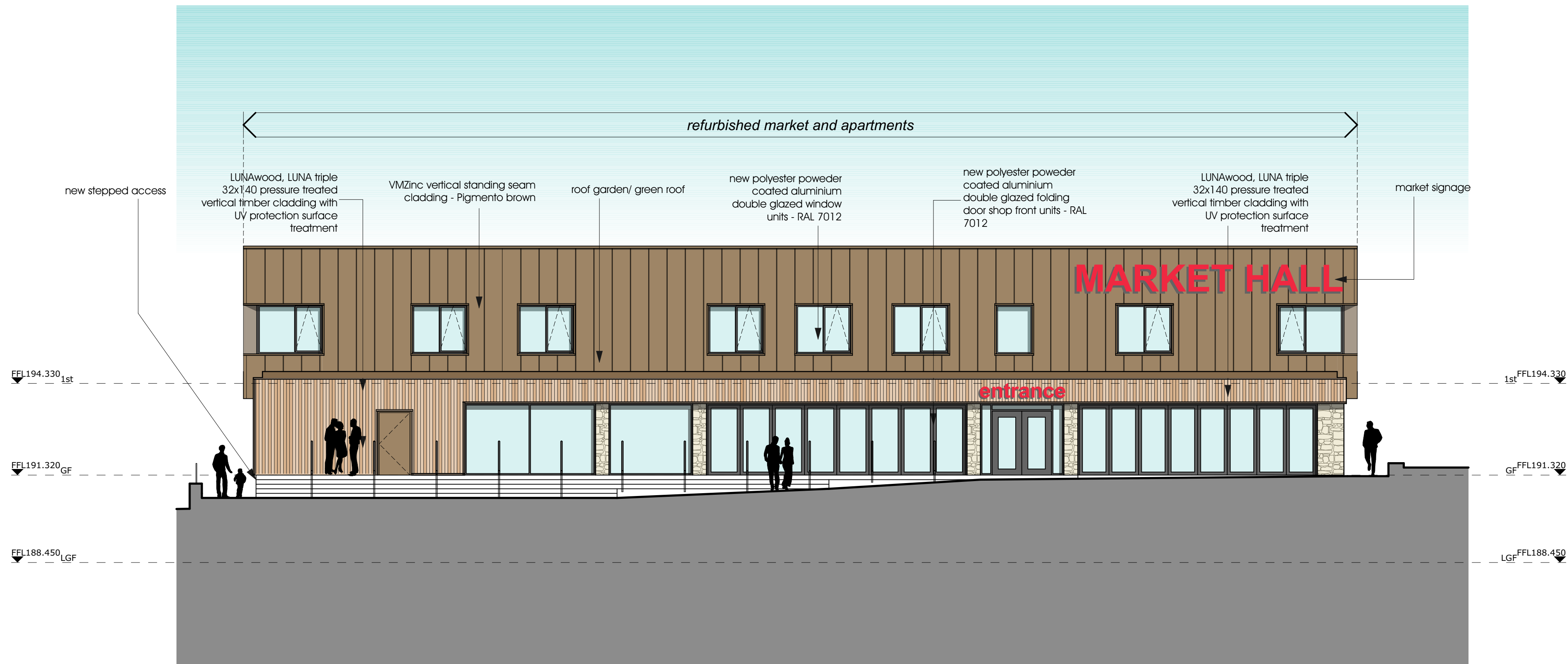
north elevation 1:100