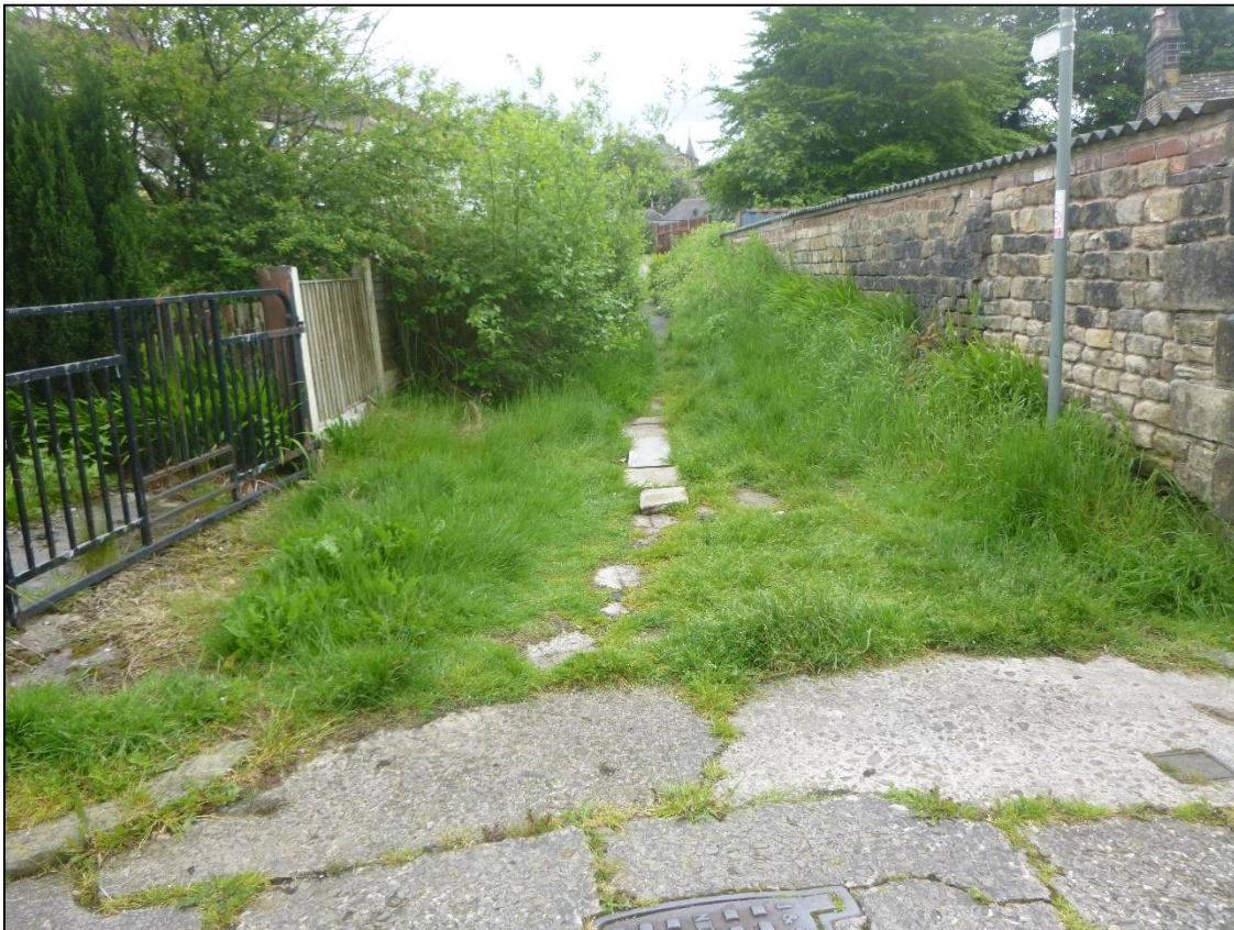
Photo from Vicarage Road end.