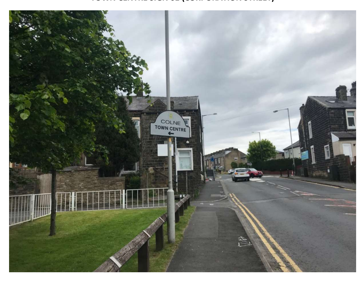
TOWN CENTRE SIGN 02 (ALBERT ROAD)