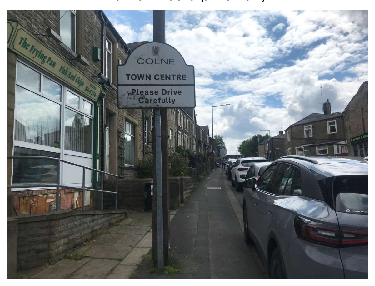
TOWN CENTRE SIGN 08 (KEIGHLEY ROAD)