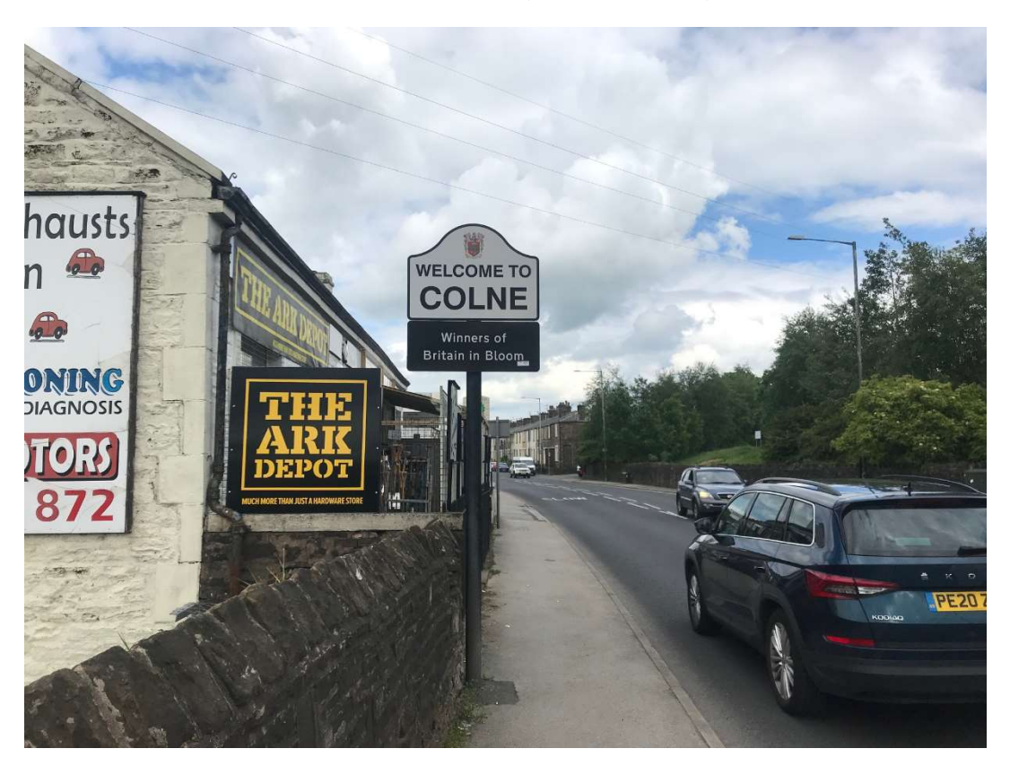
BOUNDARY SIGN 02 (VIVARY WAY)