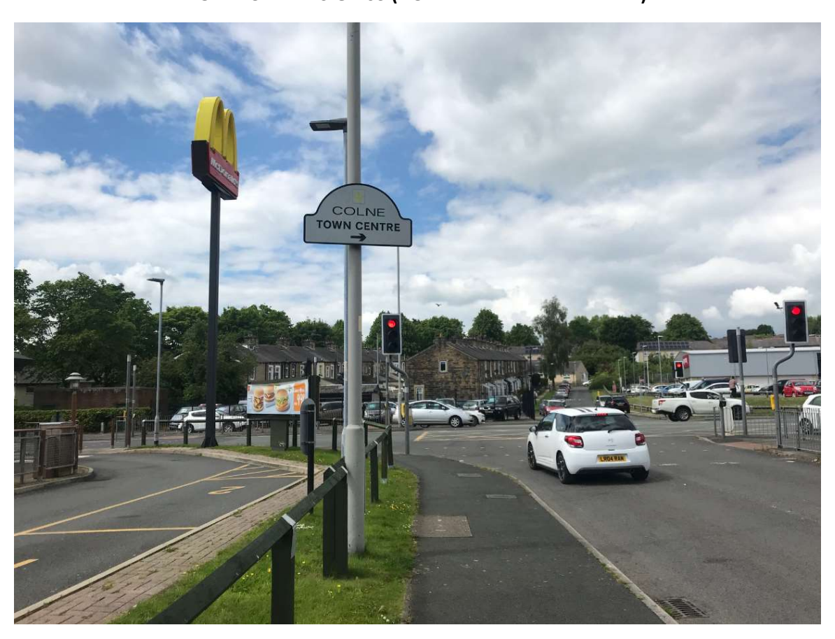
TOWN CENTRE SIGN 04 (WINDSOR STREET)