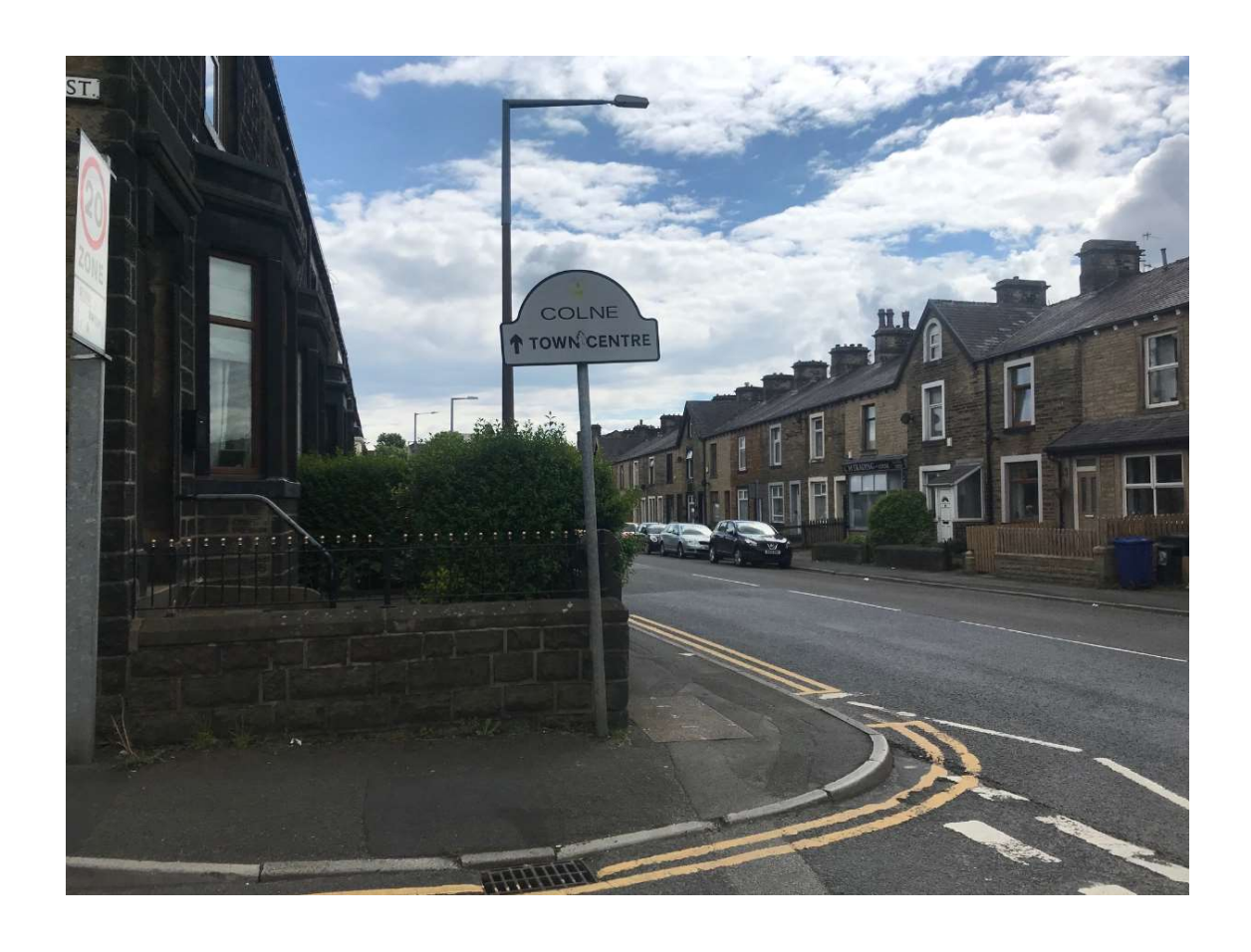
TOWN CENTRE SIGN 06 (BYRON ROAD)