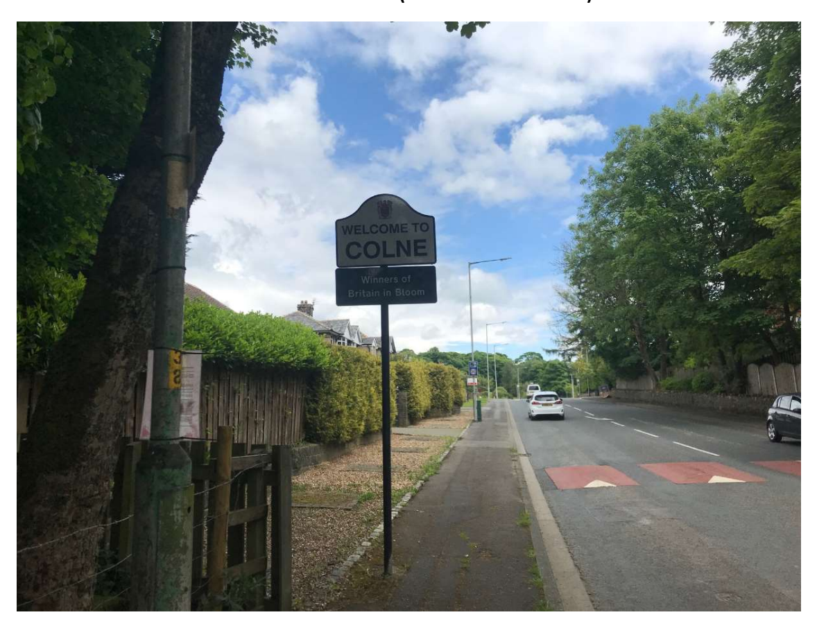
BOUNDARY SIGN 04 (SKIPTON ROAD)