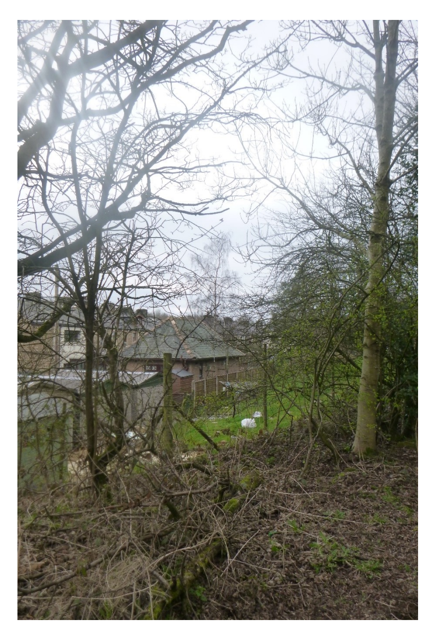
Figure 6 - Tree (middle) from tram tracks