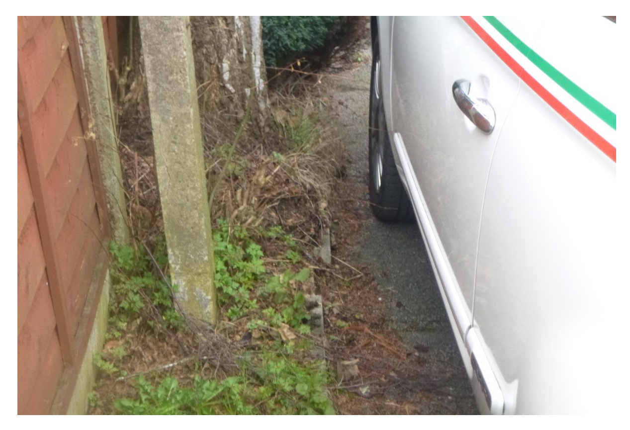
Figure 2 - Damage to kerb