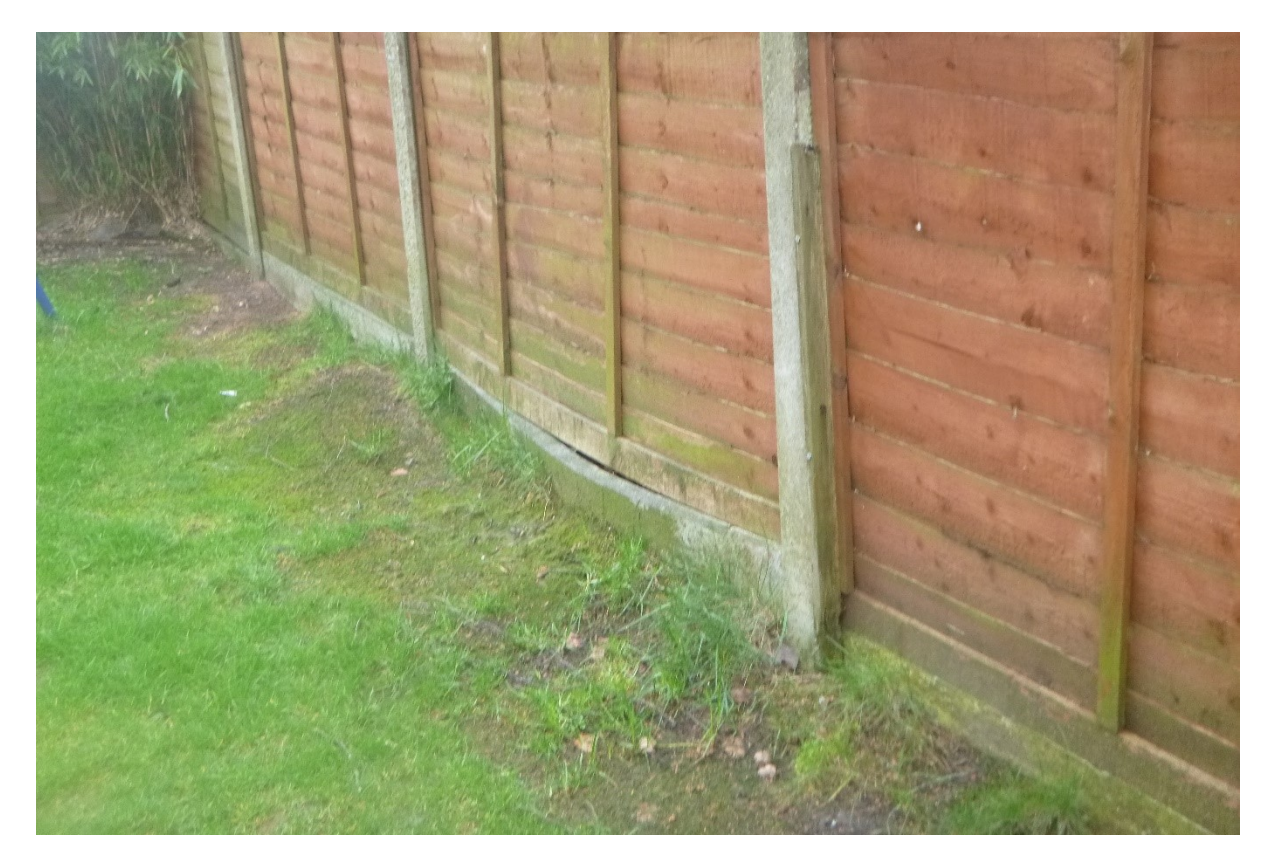
Figure 4 - Damage to fencing