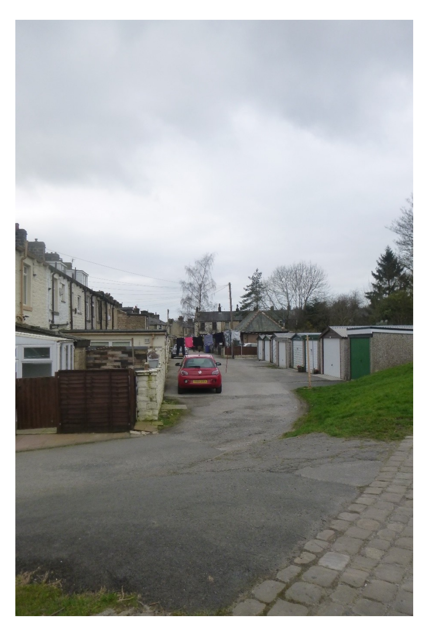
Figure 1 - Tree from adjacent to LBS building