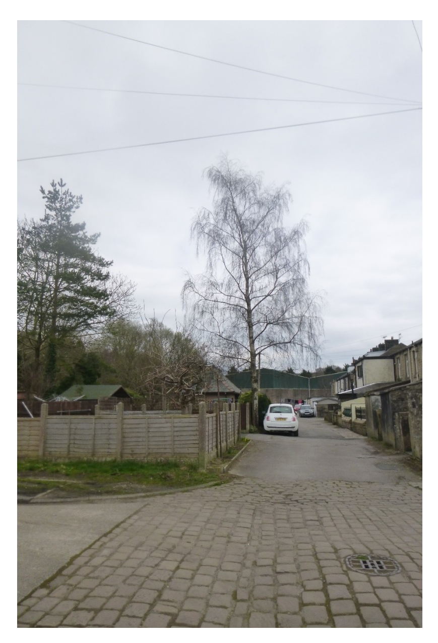
Figure 5 - Tree from Hollington Street