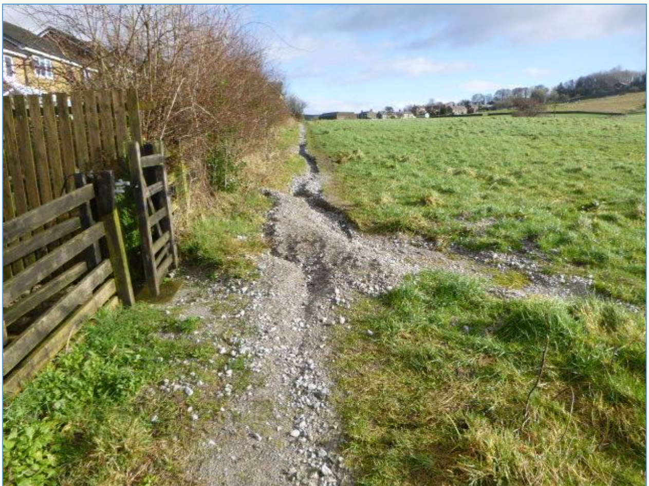
Footpath 49 looking north from the rear of Barnwood Crescent