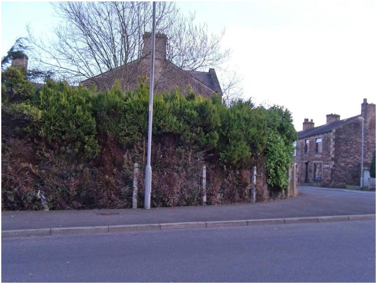
Photo – Garage Site at Nora Street and Higher Causeway, Barrowford