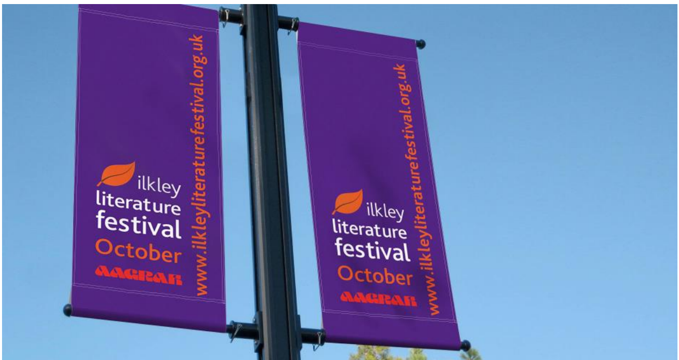
Appendix 3 – Lamppost banners/signs

Welcome to PEMBRIDGE Historic black and white village