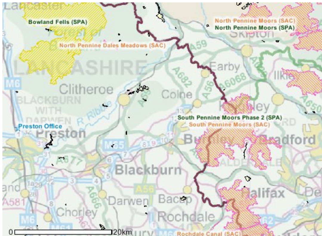
Map 1b: Ribble & Alt Estuary European Site