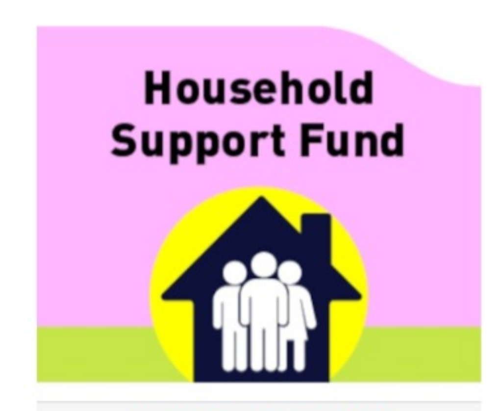
Household Support Fund

Have your say on the approved publication draft of our new Local Plan.