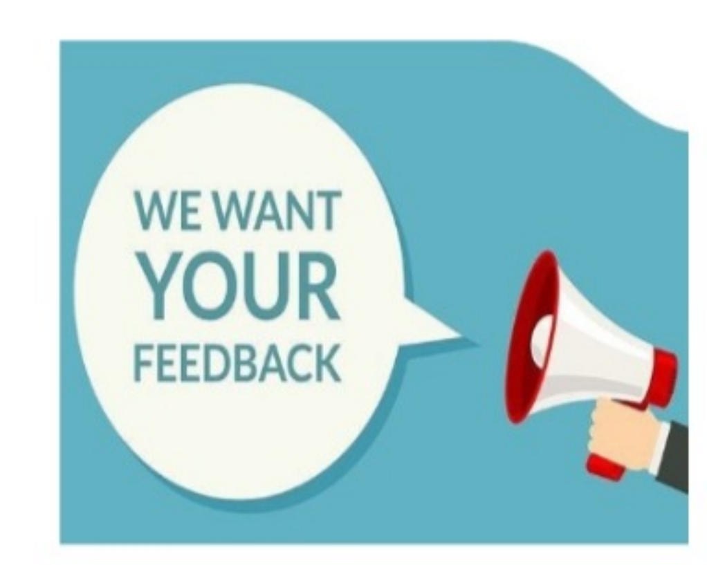
Brierfield, Barnoldswick and Earby town centre improvements

Stay up to date on the latest round of the Household Support Fund