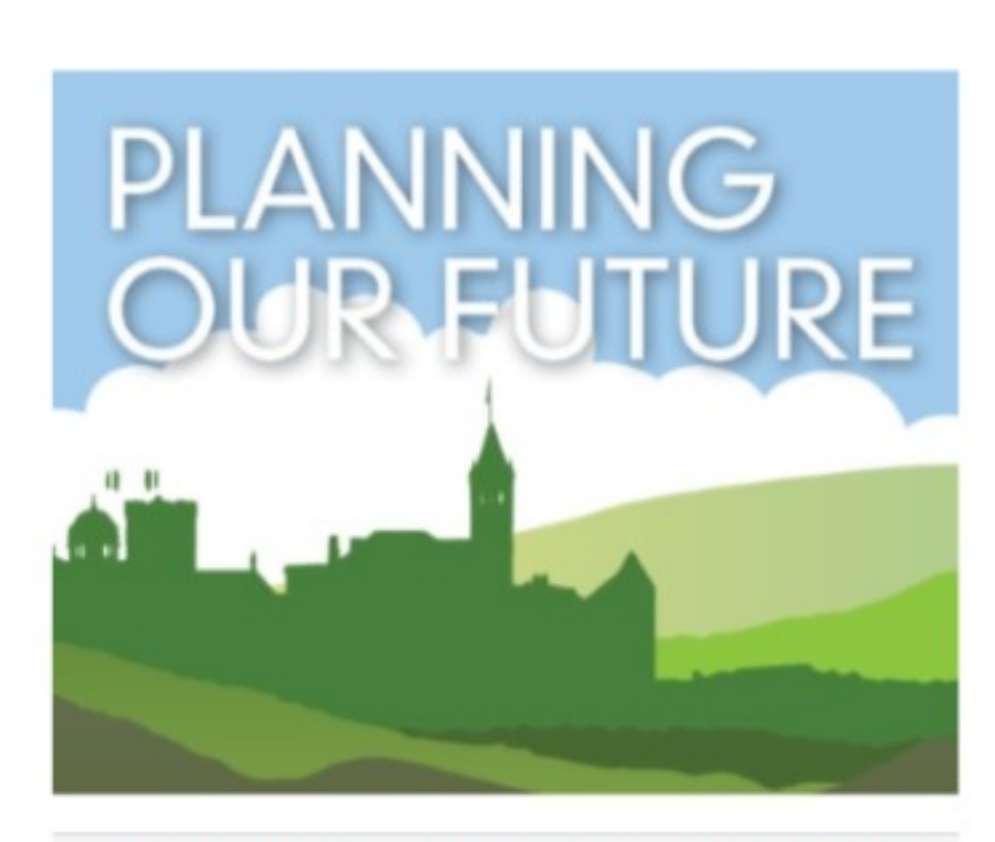
Publication Consultation - Local Plan (Publication Draft)

Have your say on the approved publication draft of our new Local Plan.