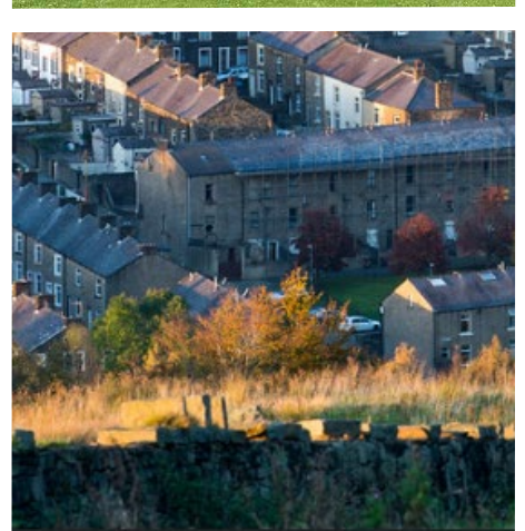
Decision Statement Regulations 19 & 20