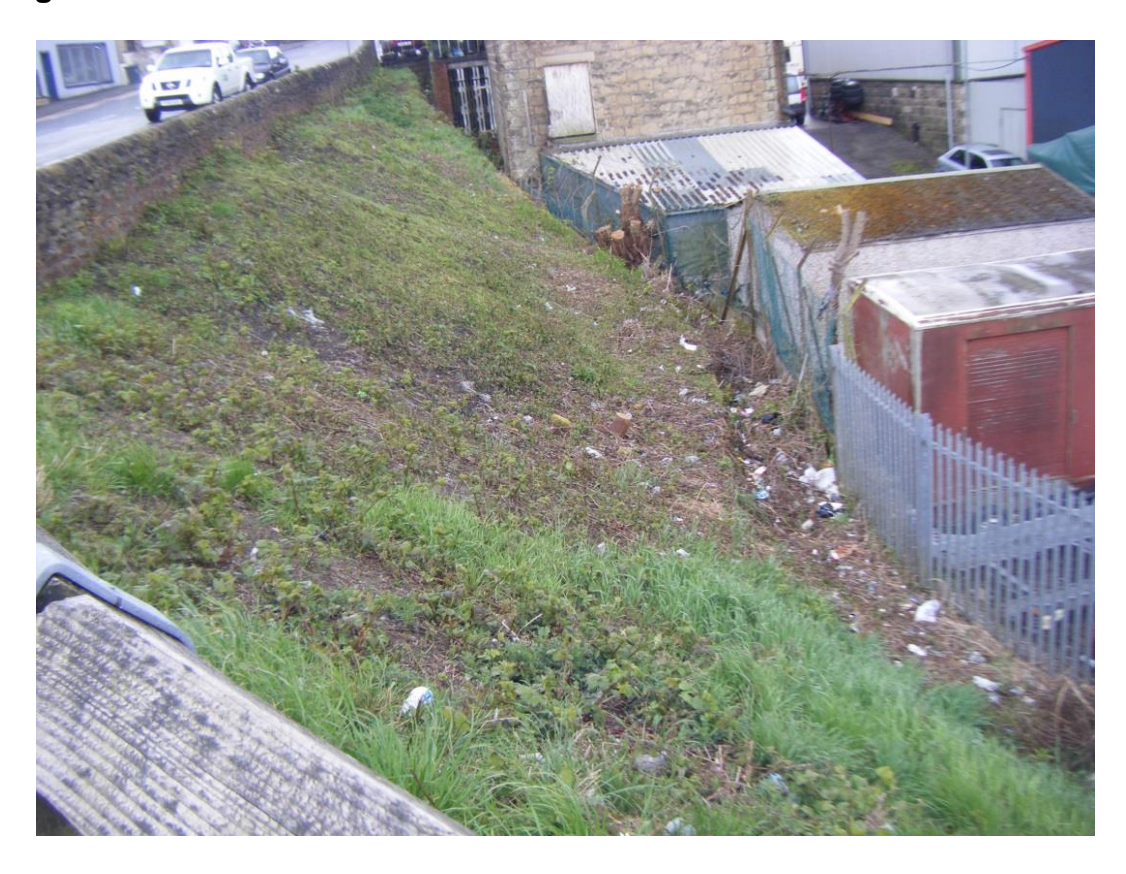
Land belonging to LCC