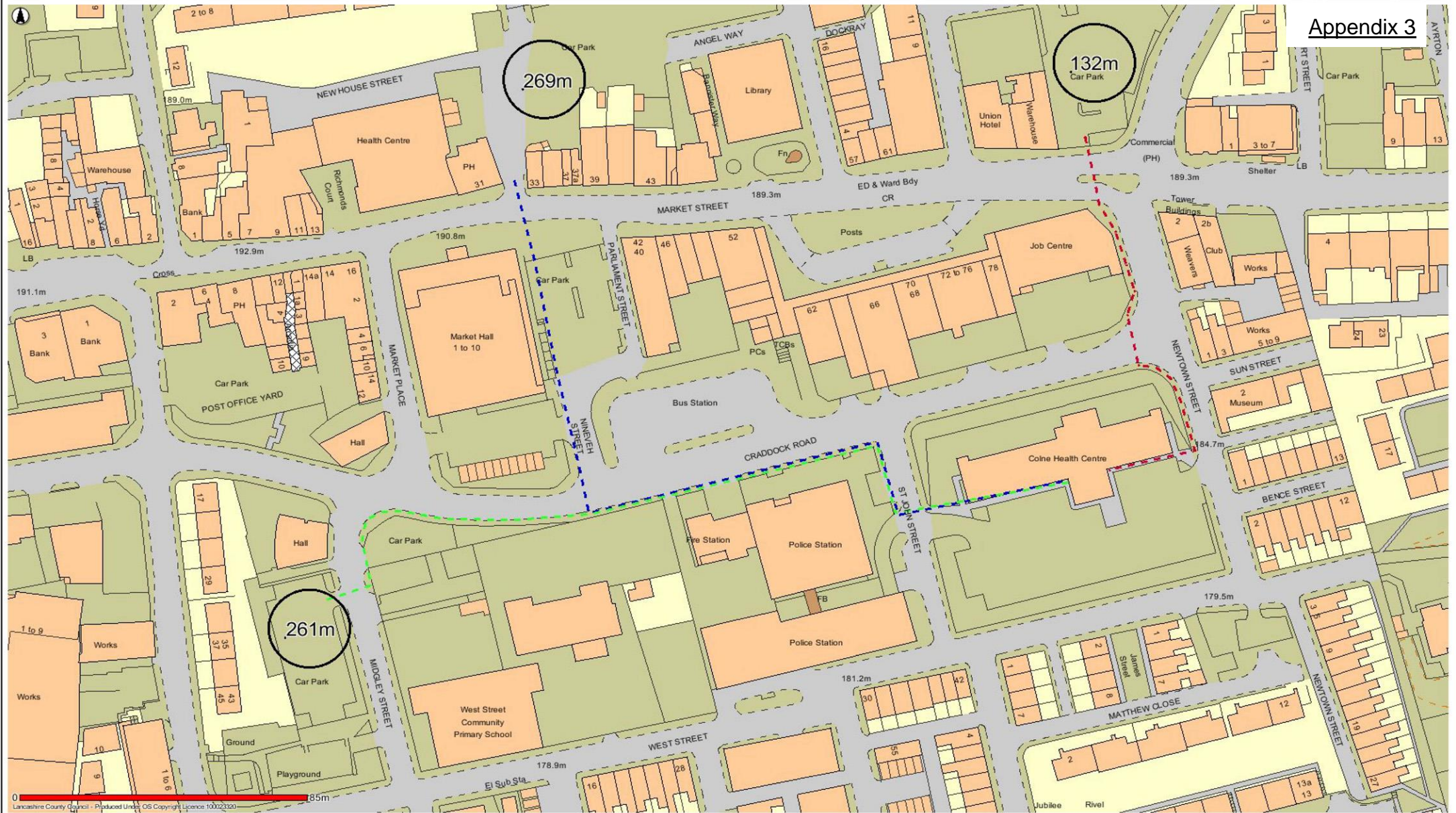
Distances from Colne Centre Carparks to Colne Health Centre