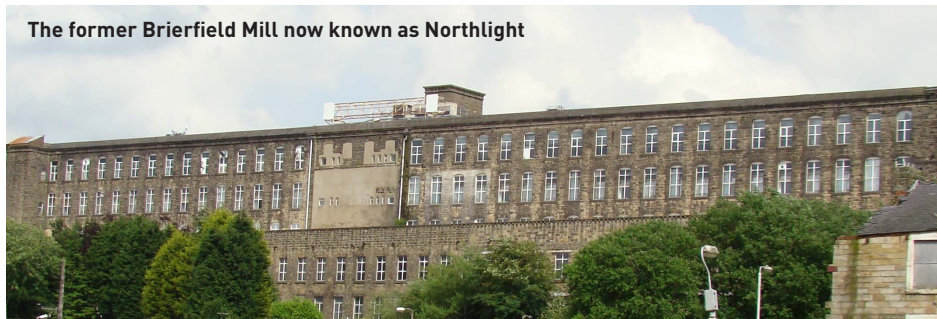
The former Brierfield Mill now known as Northlight

It's nearly two years since we adopted our Jobs and Growth Strategy. This update highlights our progress and sets out what we're planning over the next two years.