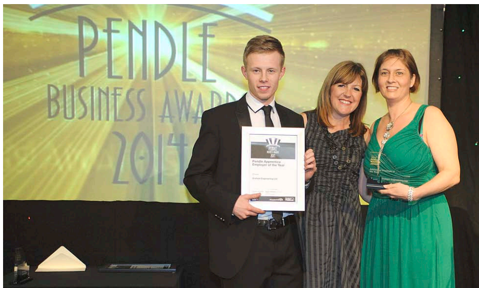
Pendle Business Awards 2014 attracted a fantastic number of entries